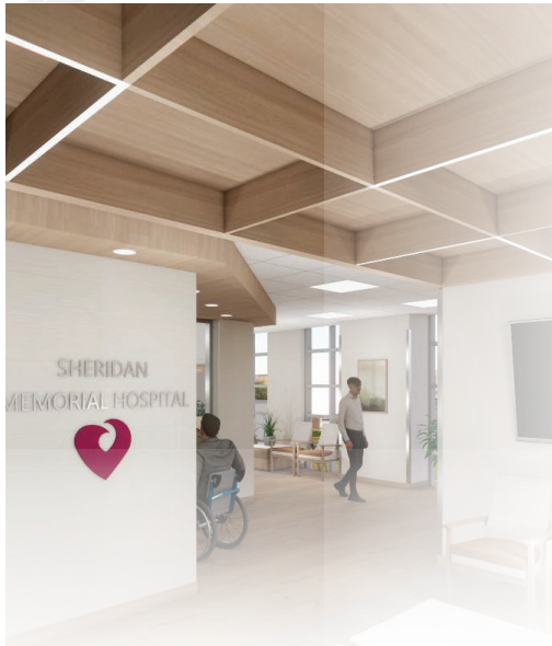
New Emergency Department entrance concept