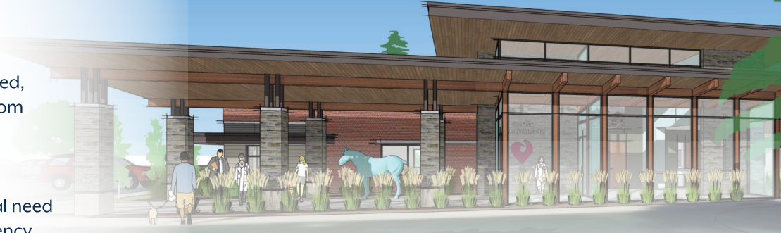
Behavioral Health entrance concept